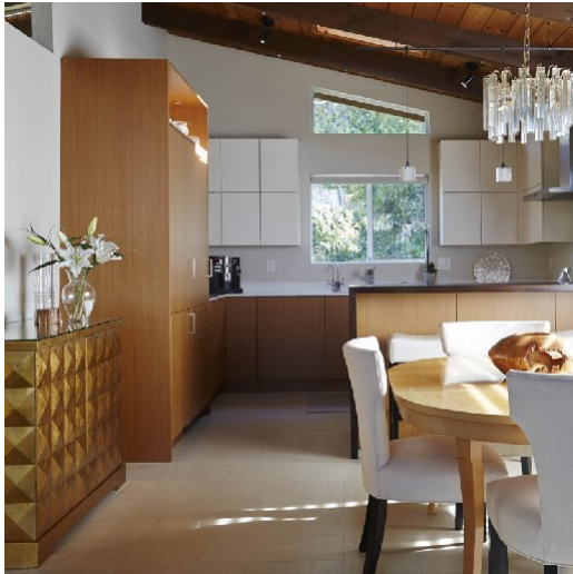
Natural - Lacquer