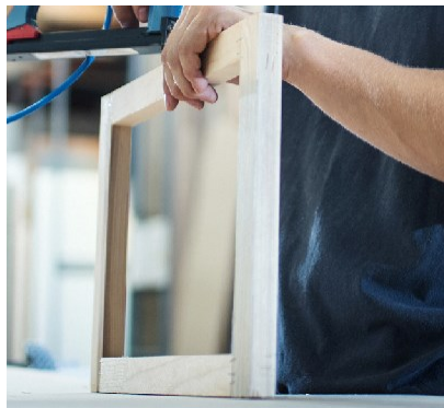
Butt-joint glued and stapled

Butt-joints are formed by two pieces of wood united end to end without overlapping. They are typically glued or stapled together. The technique of assembling the drawer involves manufacturing a box where the sides overlap the front. Glue or stapling is used to hold the piece together. The drawer front is then glued to the drawer box.