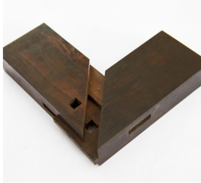
Mortise and Tenon